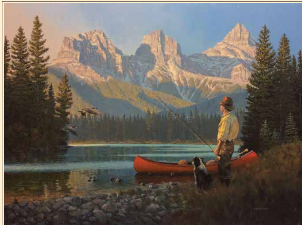
18 x 24